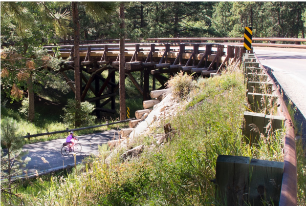
Jacquette loop- the-loop in the Black Hills where the road loops over itself in 2013.